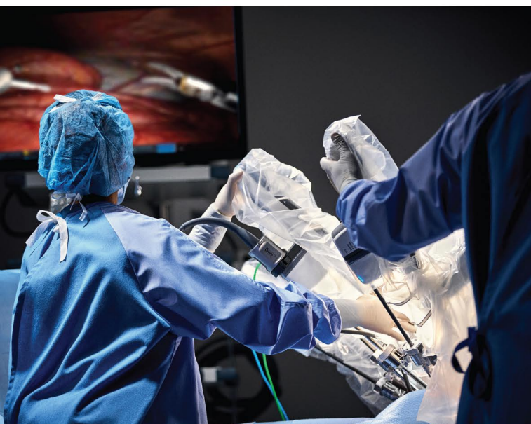
Treatment of Prostate Cancer – Robotic Prostatectomy

手術切除整個前列腺乃治療前列腺癌的方法之一，過去大多以開放方式進行，亦有少數採用微創的腹腔鏡處理。現時，許多地區已廣泛使用機械臂切除前列腺。在美國，每年使用機械臂來處理這類個案的數字，已超越傳統開放式手術。