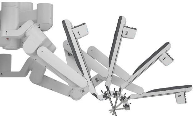
Treatment of Prostate Cancer – Robotic Prostatectomy